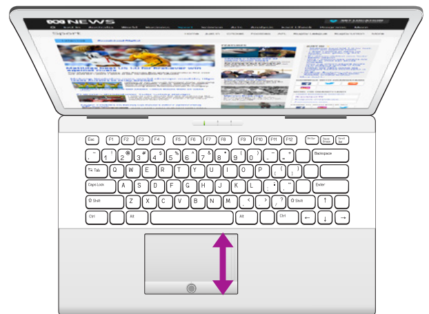
This is a touchpad

A laptop usually has a touchpad instead of a mouse.