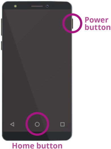
Depending on your phone, pressing the Home or Power button will wake it up

Once your phone is fully reset, the previous owner's PIN will be erased, and you will be able to create your own PIN to keep the phone and your information secure.