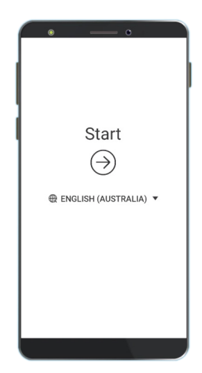
The Start screen shows you have reset your pre-owned phone