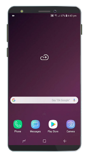
The Home screen will appear once the previous owner has unlocked your phone with their PIN

Now that your phone is safe to use, you can move on to the Setting up your new Android phone guide and complete the setup.