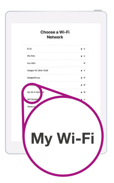
The name of your home Wi-Fi will be in the list of available networks