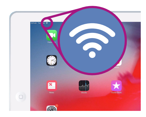
The Wi-Fi symbol shows your iPad is ready to use