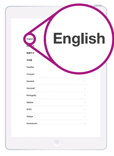
You can choose the language you want your iPad to use