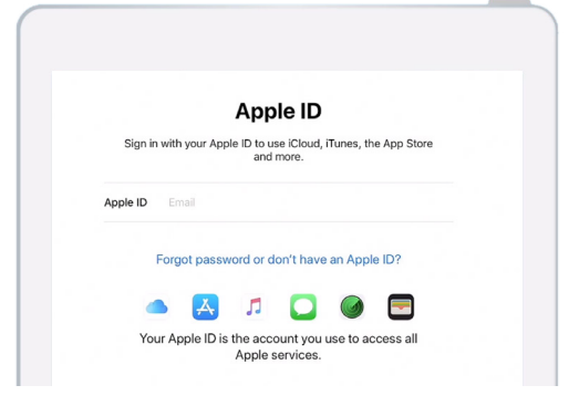
An Apple ID lets you get apps, backup photos and secure personal details