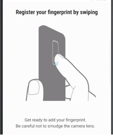
A fingerprint is one of the methods you can use to secure your phone