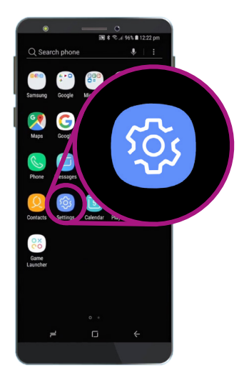
Security is controlled by the Settings app, which looks like a cog wheel

If you already have a PIN on your phone, the next few steps are similar to those for changing it, so it's a good idea to follow along.