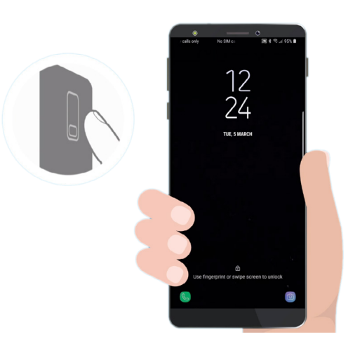
Fingerprint security can be faster and more convenient than a PIN