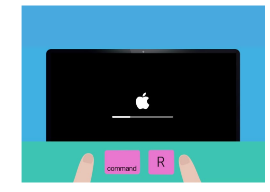
You have successfully restarted your computer when you see the Apple logo

10. If you see the Sign-in screen again, the Restart didn't quite work. Don't worry, you can try again, but you'll need the previous owner to enter their password again.