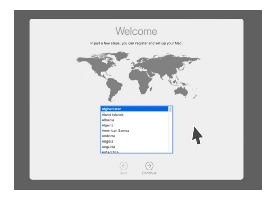
The Welcome screen tells you that the Reset is complete and that your computer is ready to set up

Once you see the Welcome screen, asking you to choose a country, your computer is reset, and ready to set up in the next course Apple laptop: Set up .