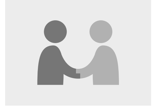
This icon appears when your computer asks to use personal information

You can click Learn More for more information, or click on the arrow above Continue to go on with setting up.