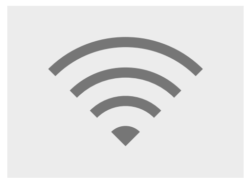
Connecting to the internet over Wi-Fi lets you set up securely with an Apple ID