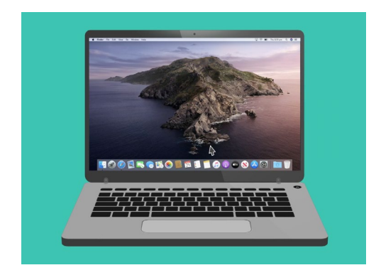
Set up is completed when the desktop screen appears