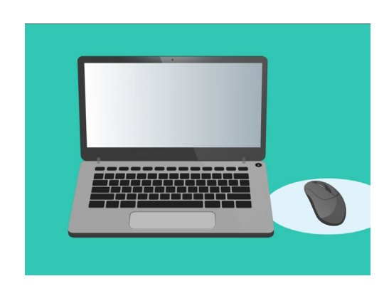
You can help protect your computer against viruses and other unwanted software