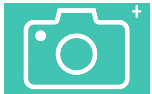
The Camera app icon is located on the Home, Lock or Apps screen