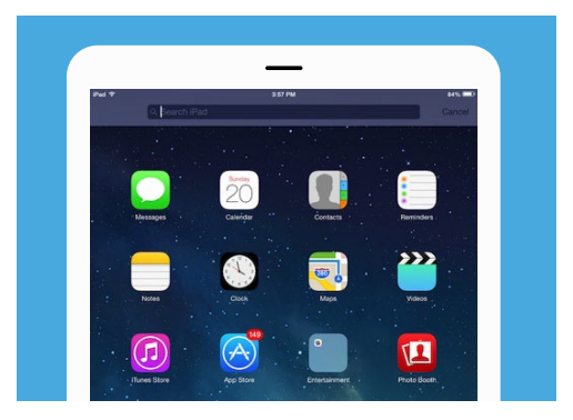
Swiping down will reveal the Search bar