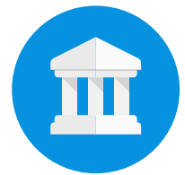
Google Arts & Culture

Learn more with Google Arts & Culture and Voyager