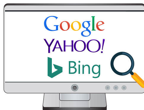
Google, Yahoo and Bing