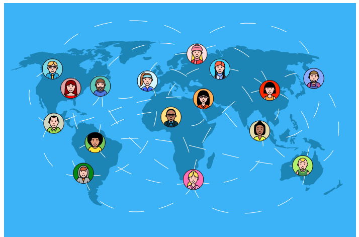
Keep in touch on a social network