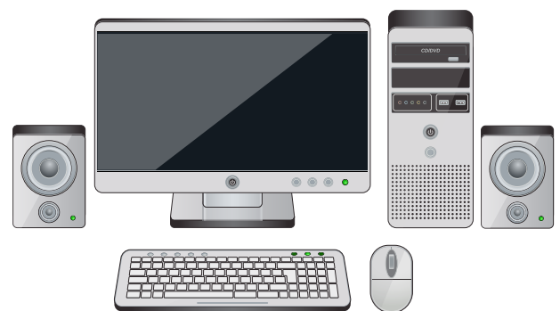
A desktop computer comes in multiple pieces