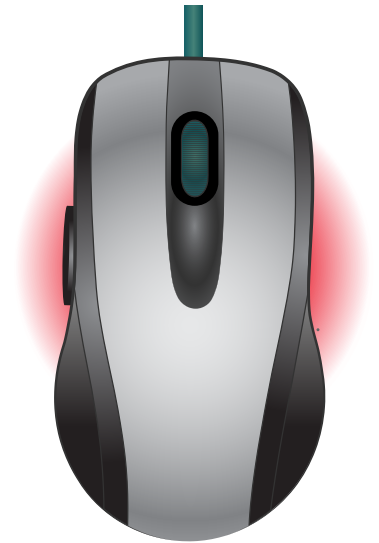
This is a mouse

Not so hard, is it? And once you have mastered the basics of the mouse and keyboard, you're ready to start your computer adventure!