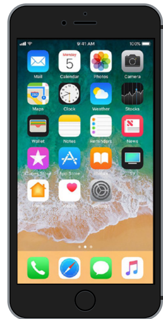
Tap the Phone icon on the screen

If it's nearly empty, you can charge the phone by plugging it into a wall socket or into a desktop or laptop computer.