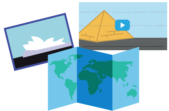
Voyager uses a range of interactive content

'Watch Google Earth come to life, with amazing images, video clips, interactive maps and more.'